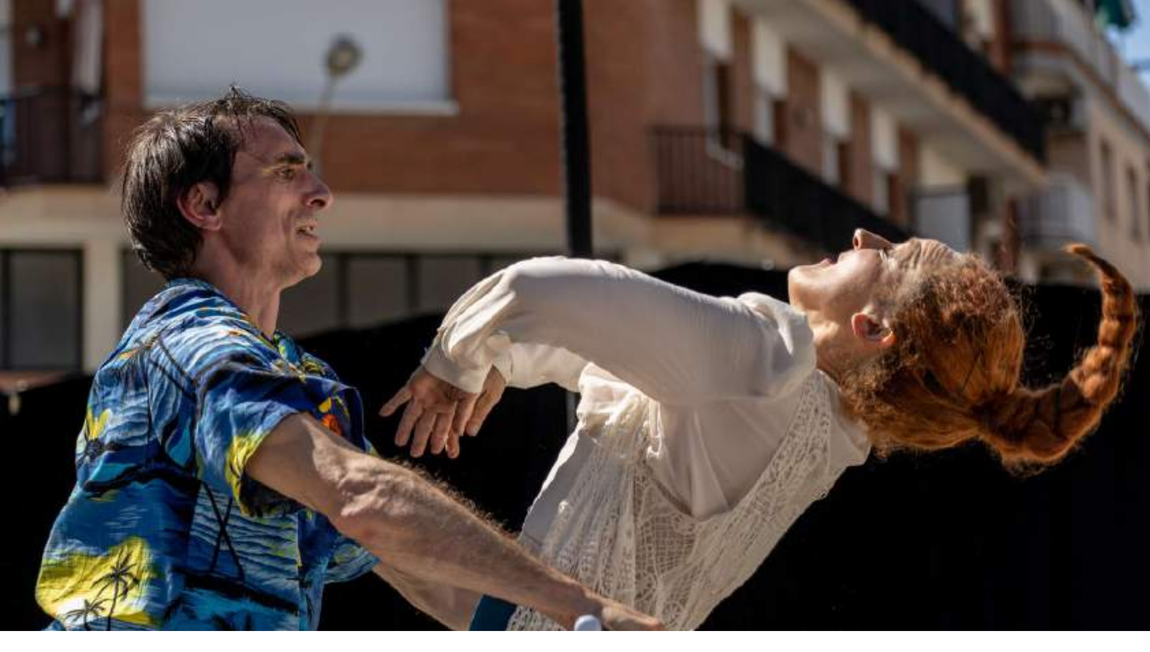
Cia. Mar Gómez is supported by